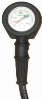
Pressure gauge and warning device

Safety valve closing pressure \geq 0.99 MPa.